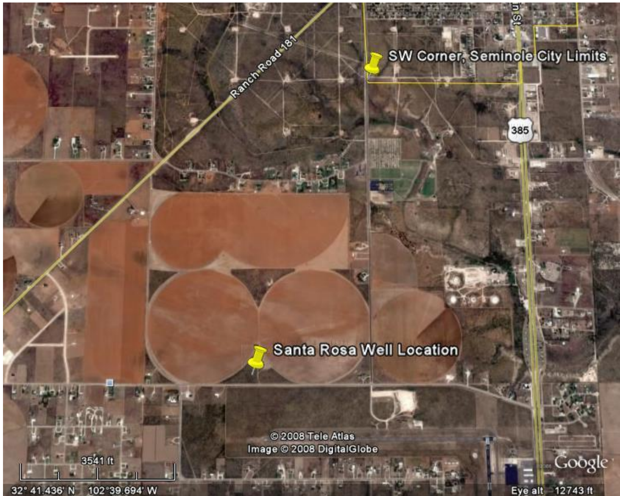
Fig. 2. Illustrating the positions of the originally-proposed Santa Rosa well location.

The specifications of the Entegriy EW-15 wind turbine are reproduced as Appendix B.